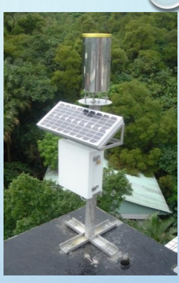
Rainfall Observation System