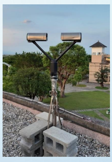
Parsivel Raindrop Spectrometer