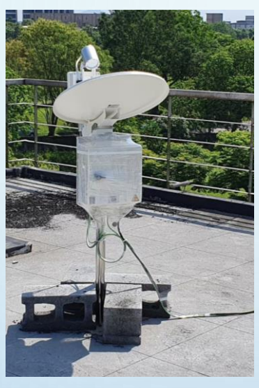
Microwave Rainfall Radar