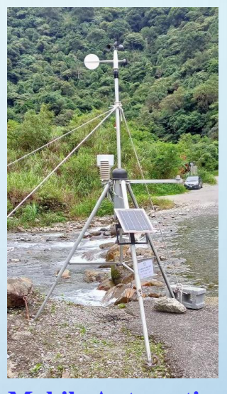
Mobile Automatic Weather Station